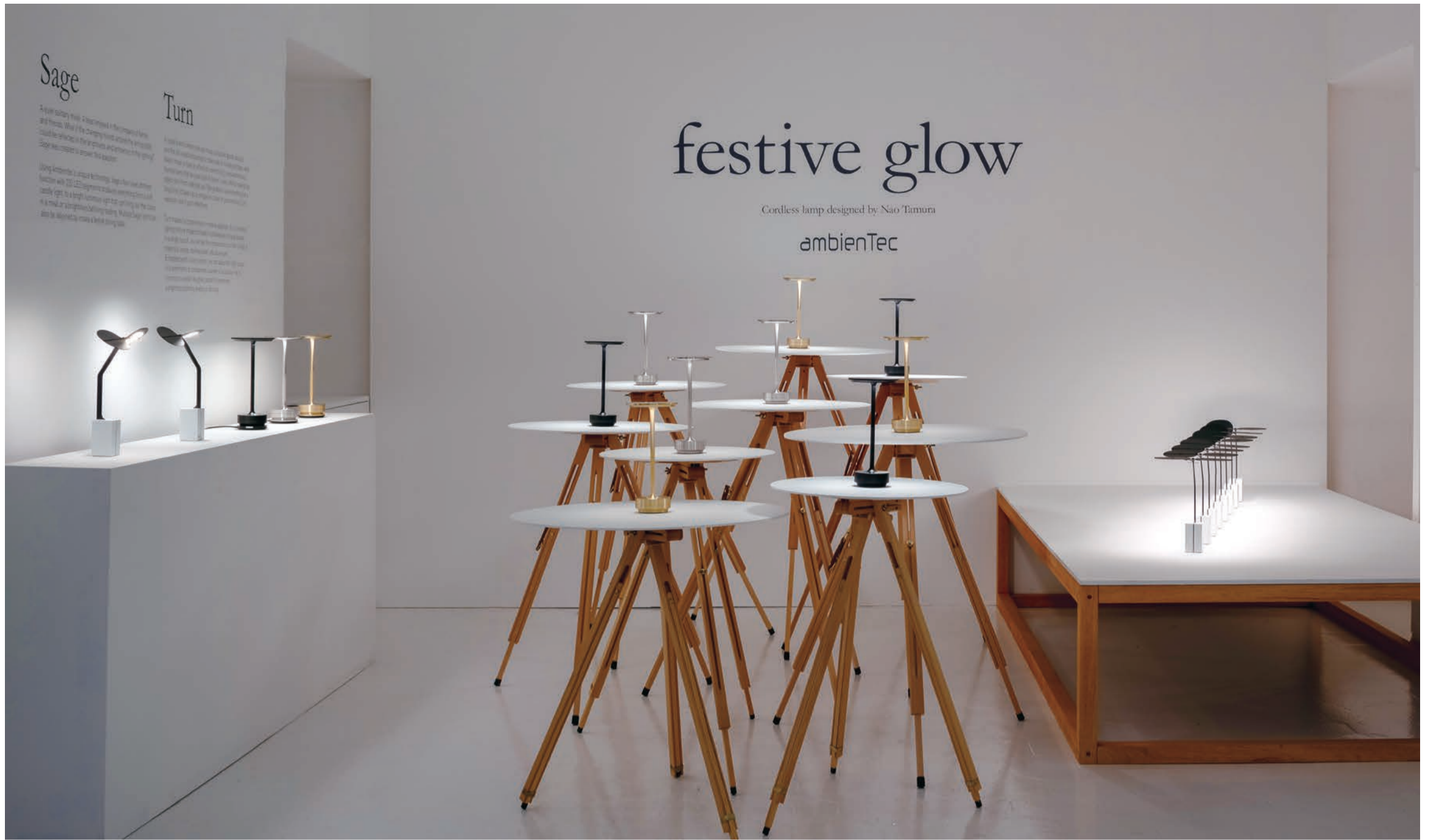
Spazio Rossana Orlandi, Milan April / 2019