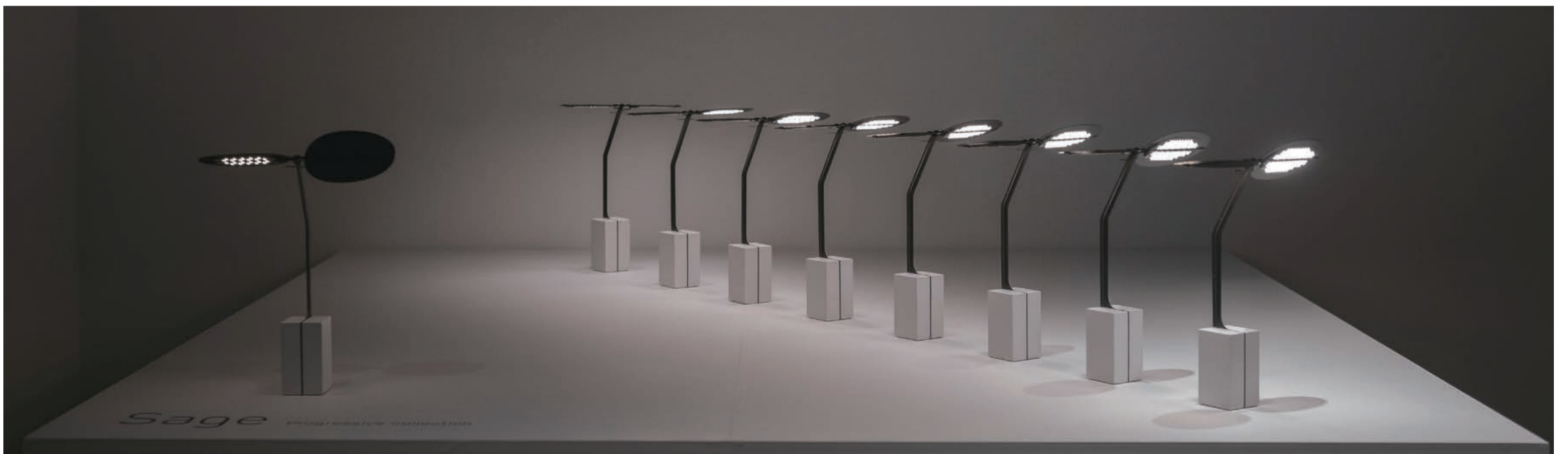
Axis Gallery, Tokyo March / 2019